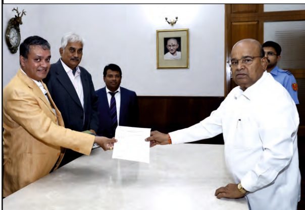
On the occasion of Inviting the Hon'ble Governor Shri Thawar Chand Gehlot for the Governor's Cup