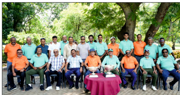
BGC vs MDGC Inter Club Tournament held at Bangalore