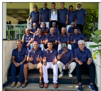
BGC vs PGC Inter Club Tournament held at PGC, Mangalore