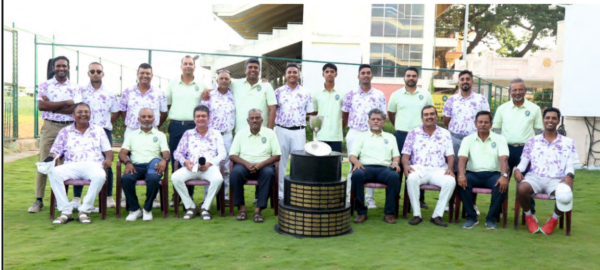
BGC vs MGC Inter Club Tournament held at Chennai