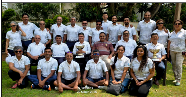
BGC vs JWGC Inter Club Tournament held at Mysore