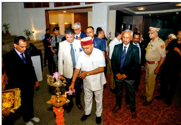
Inaguration of Governor's Cup