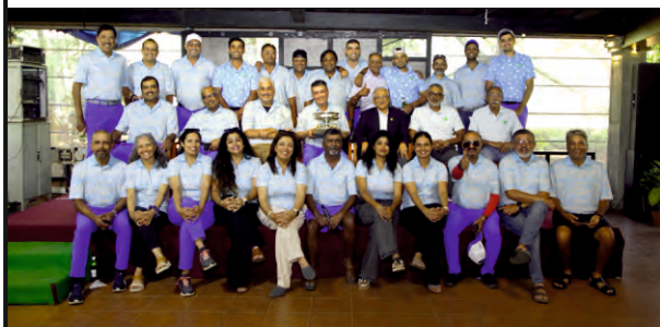
BGC vs KGA Inter Club Tournament held at Bangalore