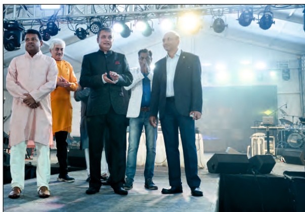
On the occasion of Deepavali Celebration