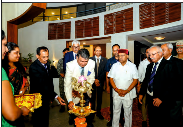
Inaguration of Governor's Cup