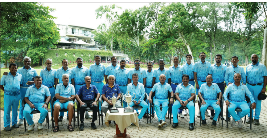
Winners of BGC vs CGC Interclub Match