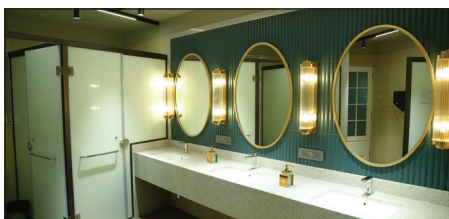
Renovated Rest Room facilities in New Club House