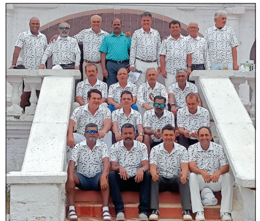
Winners of BGC vs KGF Interclub Match