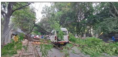
Annual tree audits and lopping a must - best time is pre-monsoon.